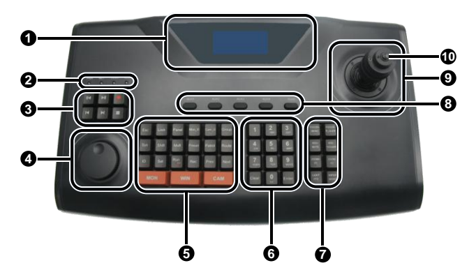
Table 1-1 Keyboard Layout