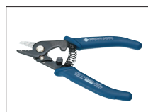
Jacket remover JR-M03