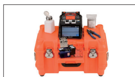
Carrying case with worktable CC-82